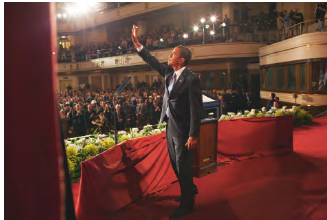
President Barack Obama waves to the crowd at the conclusion of his speech at Cairo University in Cairo, Egypt on June 4, 2009.