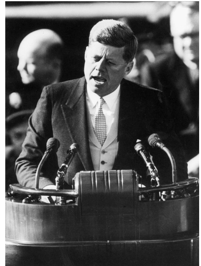
Kennedy Delivering His Inaugural Address, 20 January 1961