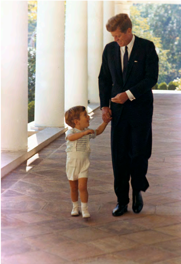
President Kennedy and Son John, 10 October 1963, White House, West Wing Colonnade