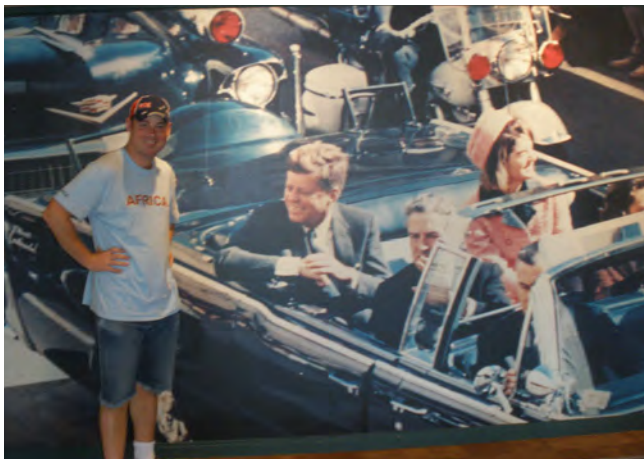
Poster of 2 November 1963 and Bystander (Poster: John F. Kennedy Museum, Boston)