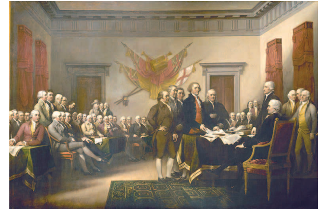
John Trumbull, Declaration of Independence , painted 1819.