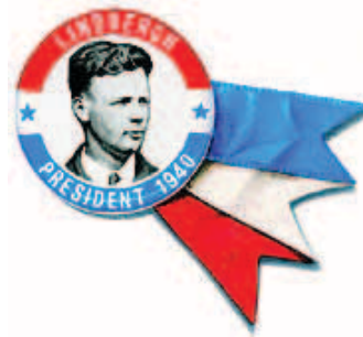
Illustration by Ed Lam for Philip Roth, “The Story Behind ‘The Plot Against America,’” The New York Times 19 Sept. 2004.